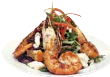
Cajun and Creole cuisine prepared by world-class chefs