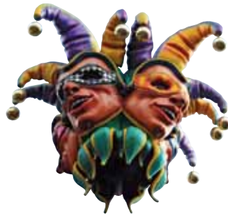
The festive spirit of Mardi Gras