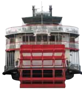
Steamboat rides along the mighty Mississippi