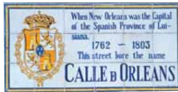
The legendary French Quarter