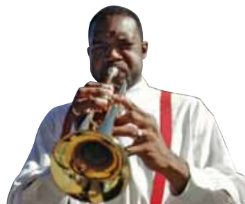
Lively music worthy of the birthplace of jazz